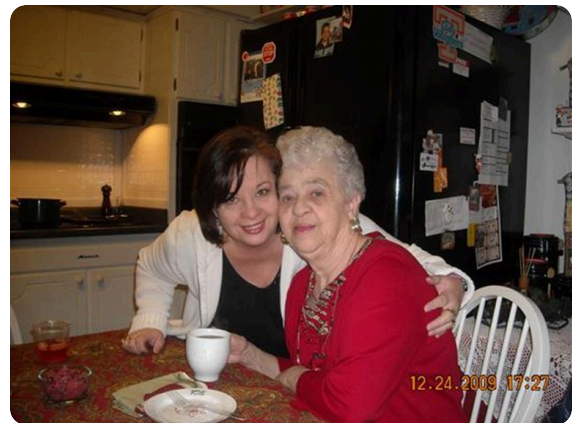
Mom and Me!